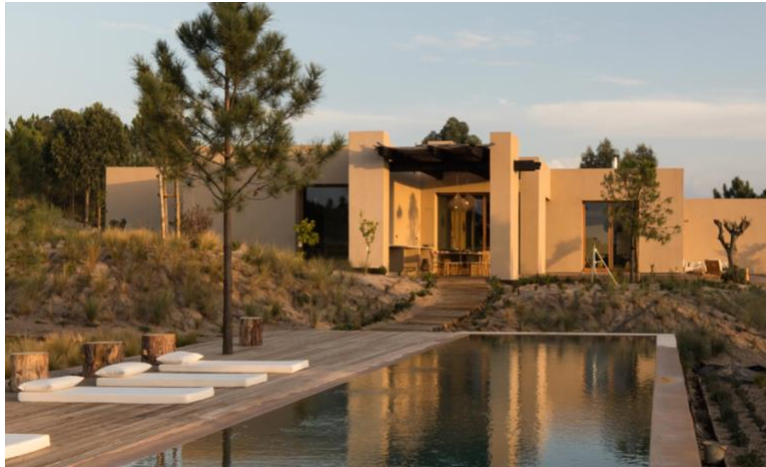
At Melides Art in Portugal, the private residences designed by Esteva i Esteva blend seamlessly with nature both in design and choice of material

From pool decking and poolside furniture to pool house construction, all areas of your backyard pool design will constantly be exposed to the elements so you should consider their materials carefully. They should withstand weather conditions and direct sunlight so you don't have to replace them every couple of years.