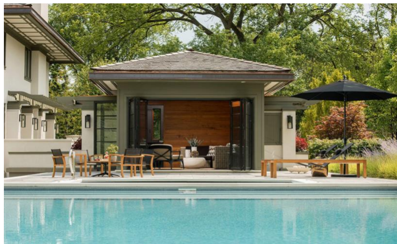
From finishes, lighting and overall styling this pool house addition by Donna Mondri blends perfectly with the rest of the home

Any extra property additions should match your home's design. Use the same colors and materials for siding and outdoor decor. Even your decking materials can draw on hues or textures surrounding your house. Every element should work together to create a luxury oasis you'll want to use with your loved ones for decades.