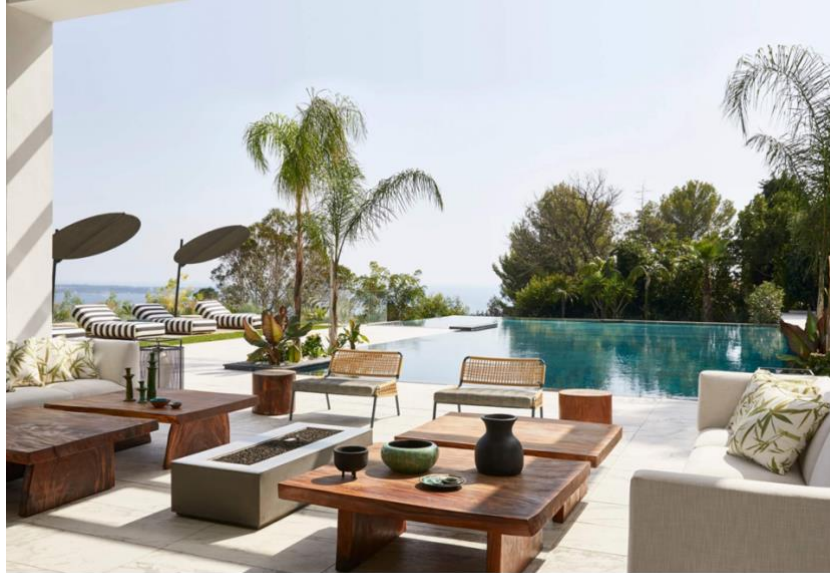
A beautiful layered curation of materials and décor shine in this Cannes Villa designed by Humbert & Poyet

Create the perfect poolside design by adding things like potted plants and textured decor. Wicker chairs or woven rugs add layers to your scenery and welcome people to a warmer environment. Browse various decor options by strolling through stores or comparing pictures online. See which textures draw your eye most often to determine your preferences.