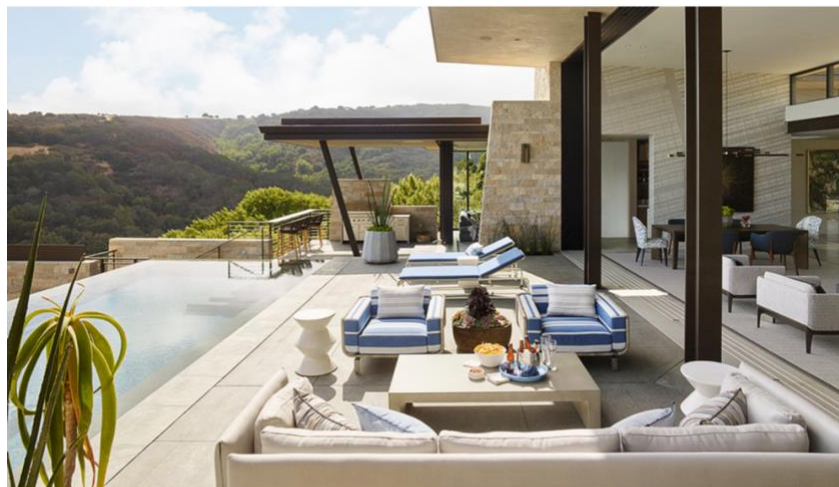
An outdoor kitchen and living area create the perfect modern luxury pool entertainment area in this design by Jay Jeffers

From an outdoor kitchen and dining area to a full-on perfectly appointed pool house, including modern conveniences will help people spend all day poolside. You could attach a kitchenette area with appliances to keep drinks cool or grill your meals. Whether covered or completely enclosed in a pool house, create a comfortable living room with ample Wifi and stock the closest bathroom with extra pool towels.