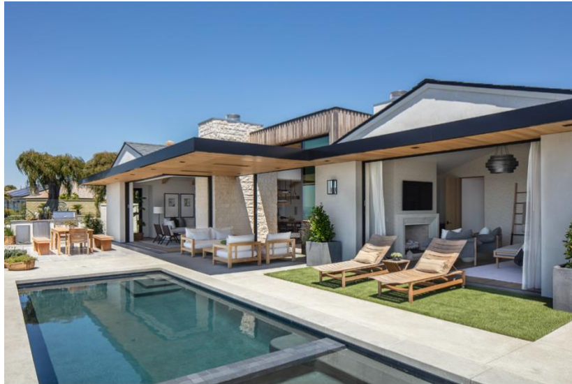
Indoors and outdoors blend seamlessly at this Montecito, CA home designed by Brandon Architects offering all the modern conveniences one could want poolside

If you don't have extra room on your property for a pool house, utilize existing structures. Open your indoors out or add a second floor to your garage to create the ultimate waterfront getaway. The second floor can hold whatever you need to make your pool experience complete. Add a TV room, a kitchen, and even a bathroom to create the perfect pool house and entertainment area.