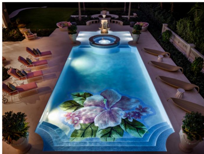
Luxurious lounge seating surrounds this stunning pool area designed by Lori Morris creating the perfect backyard pool oasis!

Even if you plan to spend all of your time in the water, luxury poolside furniture is the perfect way to complete your backyard upgrade. Consider your interior design preferences and check out pool furniture styles like wooden tables or rattan reclining chairs. They should draw the eye and compliment your pool's design so it remains the centerpiece of your backyard.