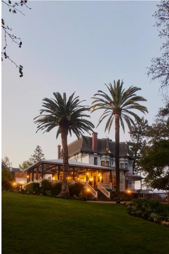
Although it may feel away from it all, The Madrona sits just one mile from downtown Healdsburg.