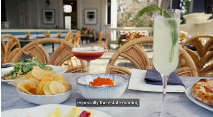
especially the estate martini,