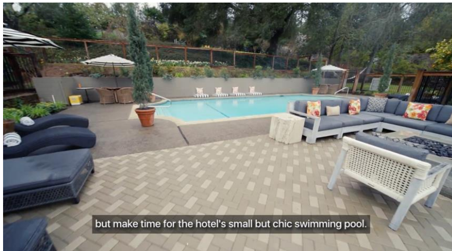
but make time for the hotel's small but chic swimming pool.

https://www.cntraveler.com/story/weekend-getaway-hotels-hot-list-2023?redirectURL=https%3A%2F%2Fwww.cntraveler.com%2Fstory%2Fweekend-getaway-hotels-hot-list-2023