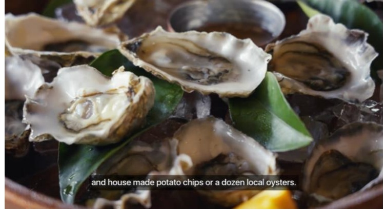
and house made potato chips or a dozen local oysters.