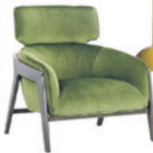
Maximus Lounge Chair in moss green, $2,067, ShopBlytheInteriors.com