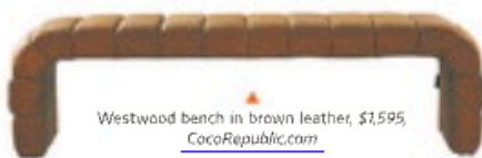
Westwood bench in brown leather, $1,595, CocoRepublic.com