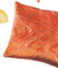
Amber Marbled Square Velvet Cushion, about $147, Susi-Bellamy.com