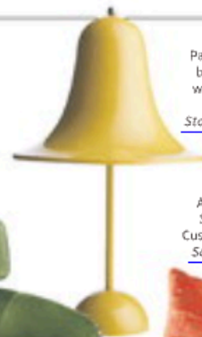
Pantop Portable Lamp in warm yellow, $150, Store.Moma.org