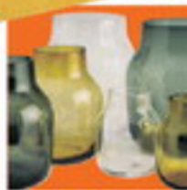
Silent Vase by Andreas Engesvik (available September 21), from $55, Us.Muuto.com